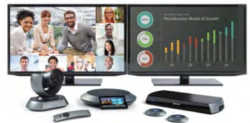
Lifesize® Icon 600™ with optional two-display configuration for screen sharing, Lifesize® Camera 10x™, plus Lifesize Digital MicPods attached to Lifesize Phone HD for large rooms.

*Not applicable with Lifesize® Icon 400™ or Lifesize® Icon 450™