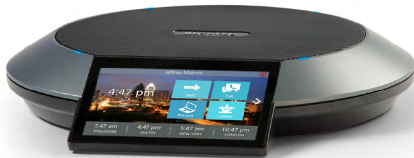
Large display with easy-to-use, touchscreen interface

It's time to work smarter. By delivering our radically simple cloud-based audio, web and video conferencing service connected to our incredible conference room systems, Lifesize® Cloud 1 ensures that your best business decisions are made in person no matter where people happen to be. And in the conference room, Lifesize® Phone™ HD is an essential part of the experience. Users can share content, launch calls, join meetings, change layouts and do more with ease. Lifesize Phone HD is your connection to all of the benefits of Lifesize Cloud wrapped up in a beautiful, easy-to-use package.